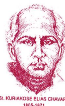
ST. KURIKOSE ELIAS CHAVARA 1805-1871

Chavara Hills, P.B. No. 3105, Kakkanad P.O. Kochi 682 030, Kerala, India