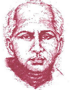
ST. KURIAKOSE ELIAS CHAVARA 1805-1871

Chavara Hills, P.B. No. 3105, Kakkanad P.O. Kochi 682 030, Kerala, India