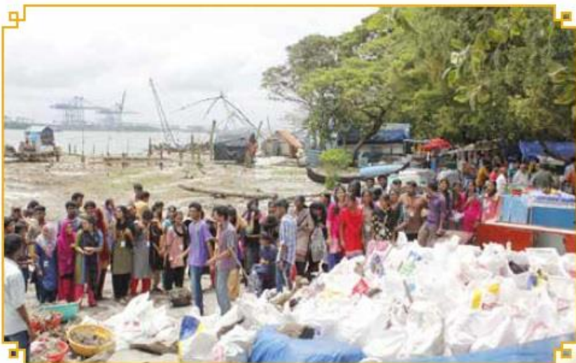
Efforts of SH College, Thevara, to Clean Up Fort Kochi Beach