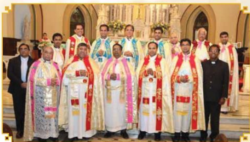
Saint Chavara Feast, USA, November 2017