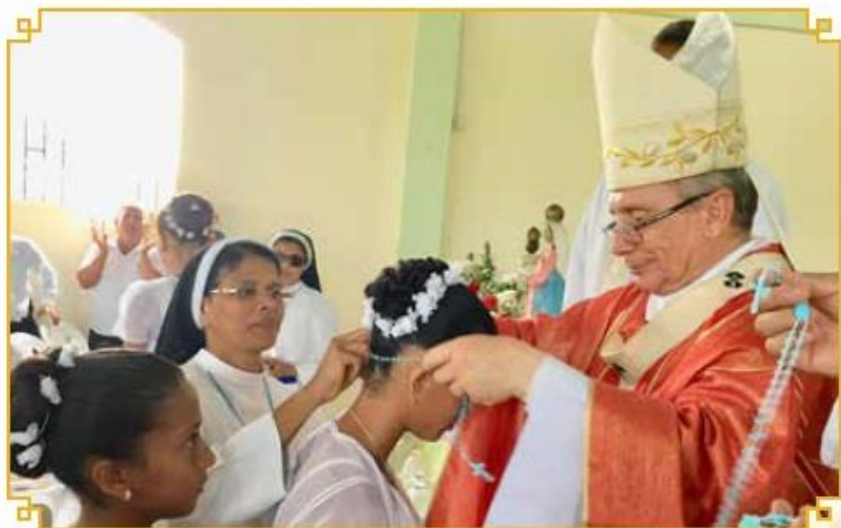
Perpetuating Marian Devotion in Ecuador