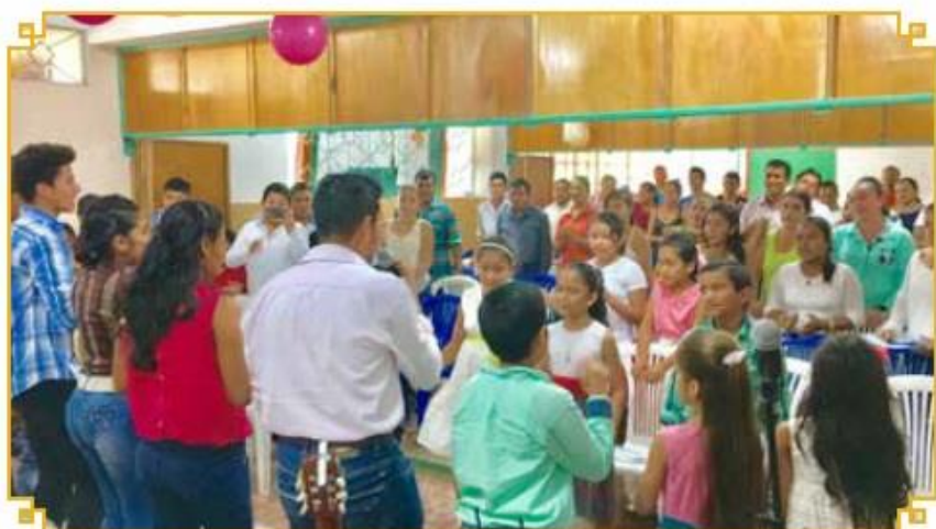
Women and Children Empowerment Centre in Ecuador