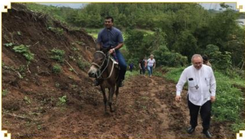
A Bishop and a Priest Reaching out to Mission Stations in Ecuador through Tough Terrains