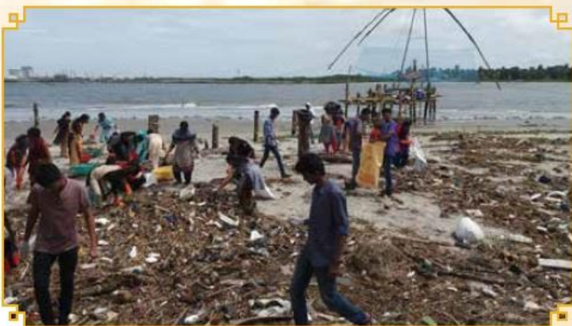
Efforts to Clean Up Fort Kochi Beach by Students of SH College, Thevara