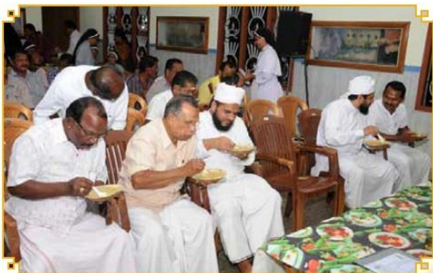
Celebrating Ramayana Month with Karkkidaka Kanji at Azhikode