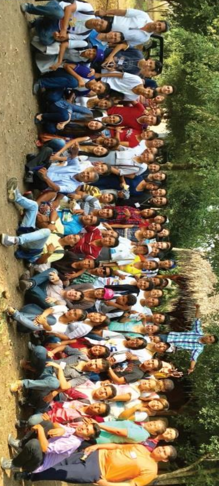
An Empowerment Get-Together of Parish Youth in Ecuador