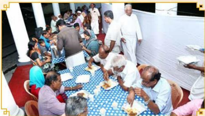
Iftar Dinner at Mar Thoma Shrine Azhikode