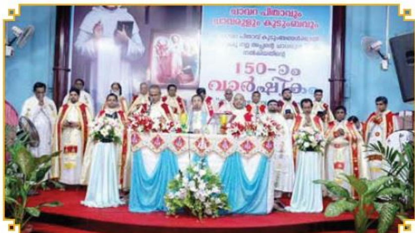
150 Years of Chavarul at Jerusalem Retretat Centre, Thrissur