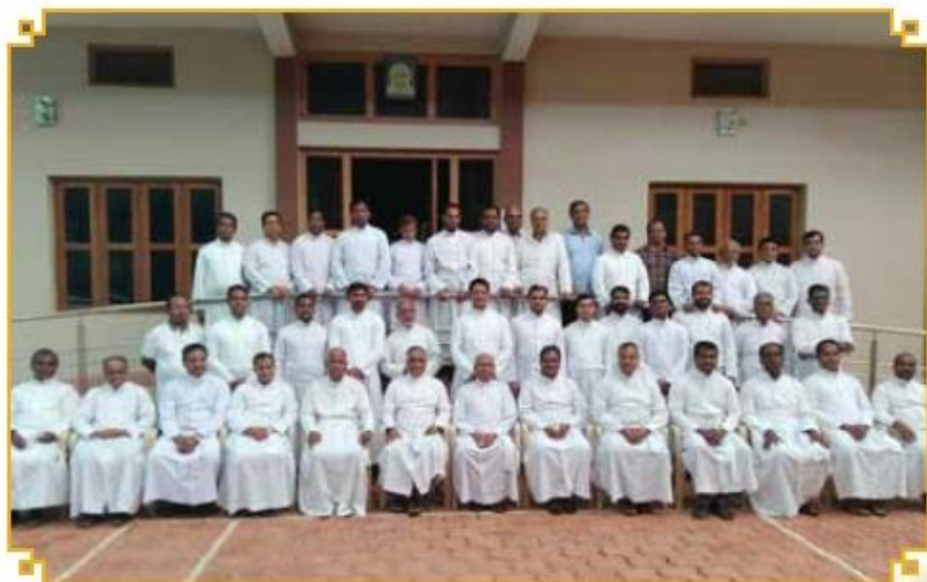
CMI Superiors' Animation in Jagdalpur