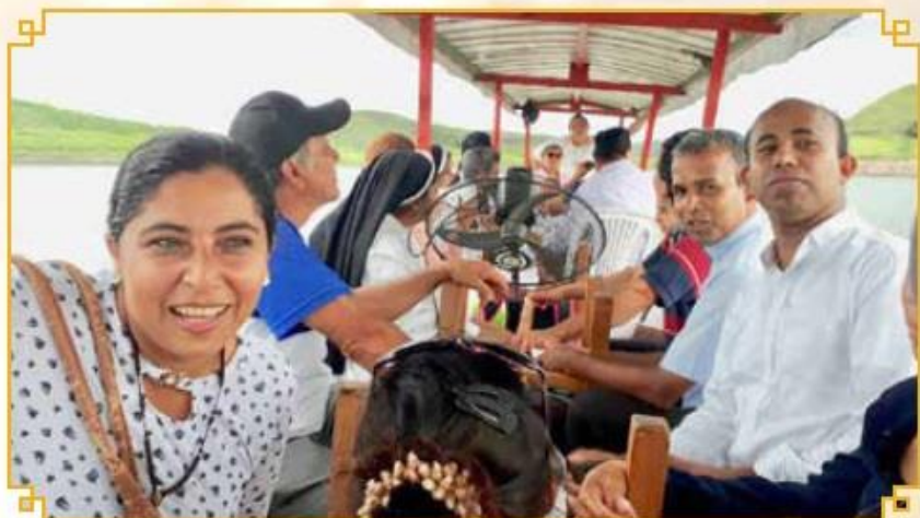
On Board a Boat to Celebrate Eucharist in a Mission Station in Ecuador