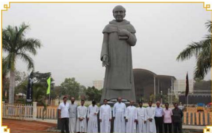
Saint Chavara Edu-Park, Chavara School, Coimbatore