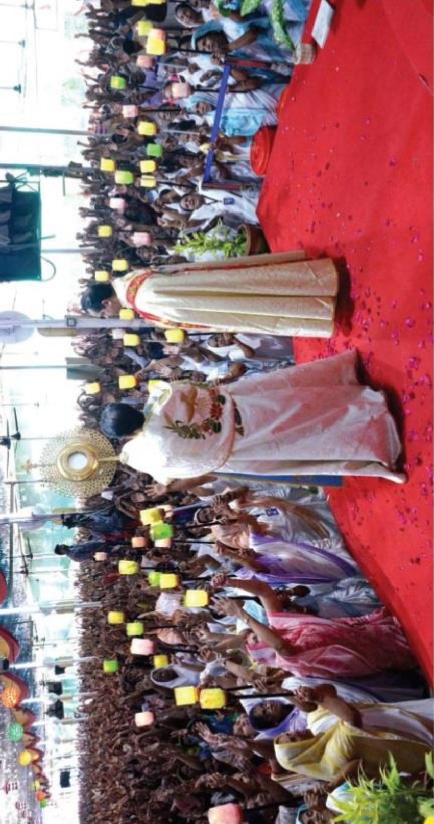
150 Years of Chavarul at Jerusalem Retreat Centre, Thrissur