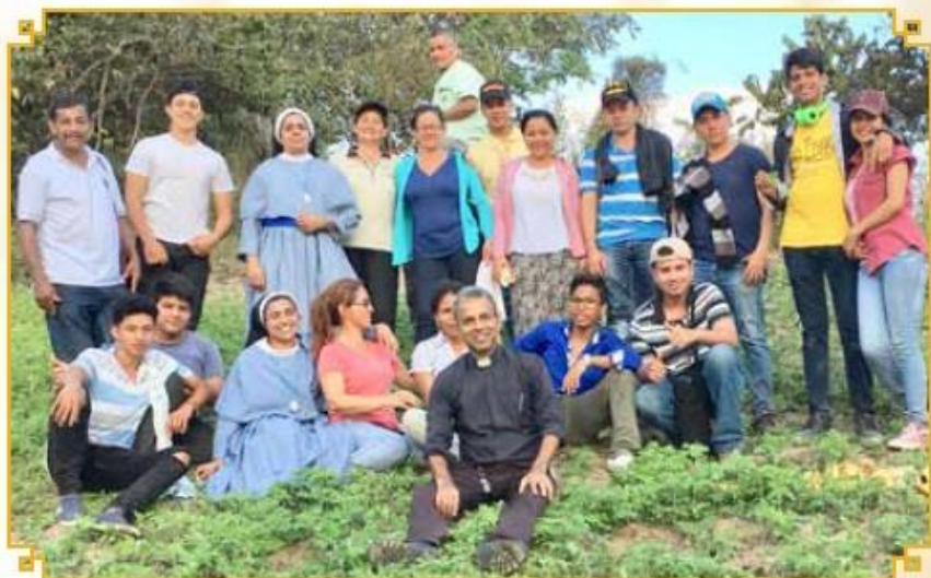
Ecuadorean Missionaries during ar Pastoral Visit