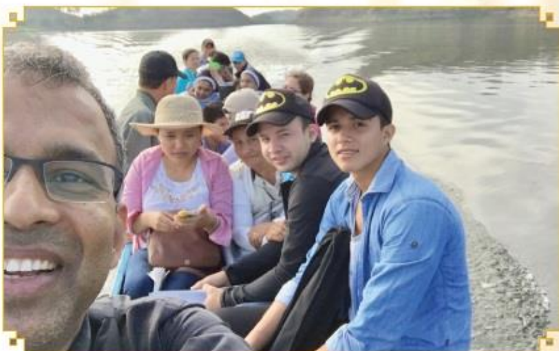
Trip to a Mission Station inside a Reservoir Area in Ecuador