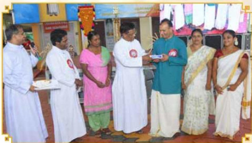
Release of Chavara Pen at Chavara Bhavan, Kainakary, during Kainakary Chavara Cultural Fest 2017